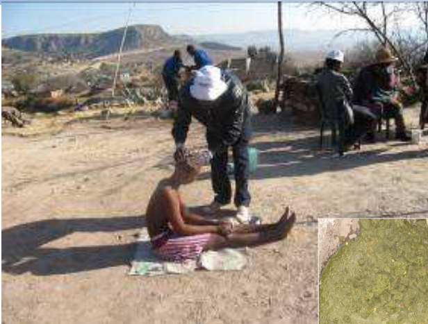
khutsana) Cleansing ceremony done when a person has lost (one/both parents. This also applies to women when they have lost either the husband or a child.