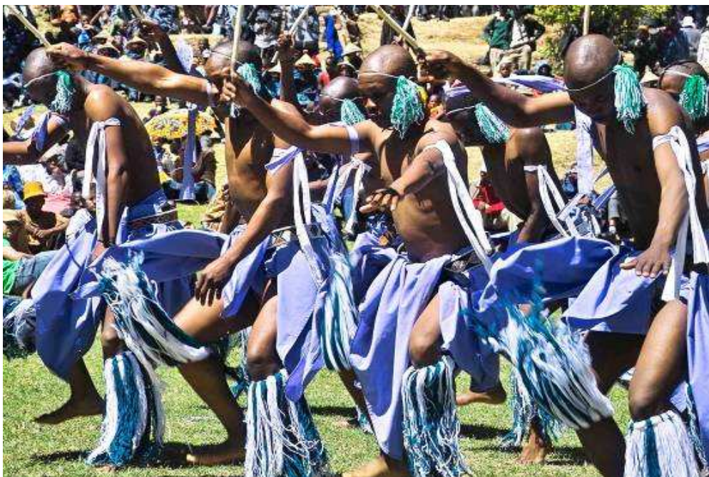
Ndlamu ( Striding Dance ) - This dance features men striding, leaping, and in some cases, sliding, and almost slithering along the ground.

Culture is of crucial importance in the development of a nation, and its integration as it ensures that economic development is in line with philosophical values and social values. Culture must be seen as integral part to development, and since development cannot take place without the full support and participation of the people, it is essential that all Basotho participate actively in the creation and promotion of a culture that is responsive to their needs and aspirations.