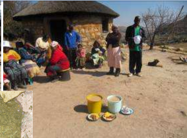
Traditional ceremony (Pha-balimo)

Culture is of crucial importance in the development of a nation, and its integration as it ensures that economic development is in line with philosophical values and social values. Culture must be seen as integral part to development, and since development cannot take place without the full support and participation of the people, it is essential that all Basotho participate actively in the creation and promotion of a culture that is responsive to their needs and aspirations.