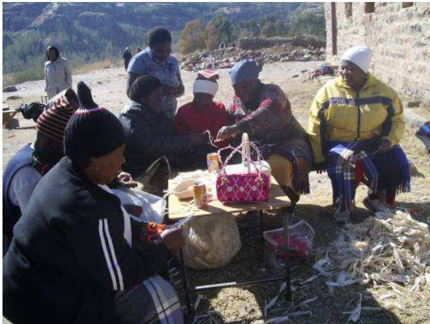
Menkhoaneng women during the crafts training workshop