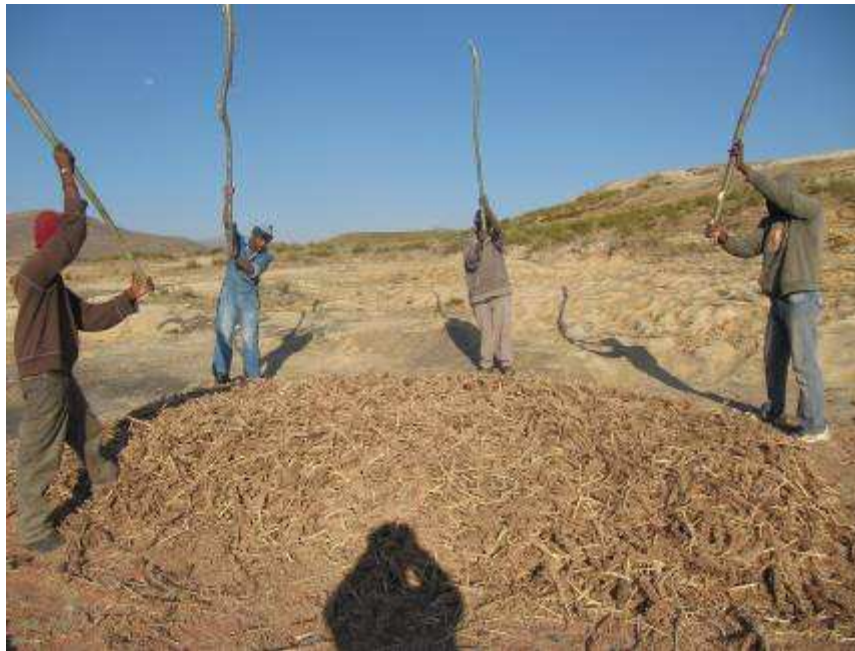
Men thresh sorghum using sticks

Communities still team up together to get certain tasks done. Letsema is a Sesotho word which describes a traditional partnership of the coming together of villagers to accomplish a heavier task that would take single person days to complete. The owner of the task will prepare food for the people and in most cases it becomes more or less like a feast.