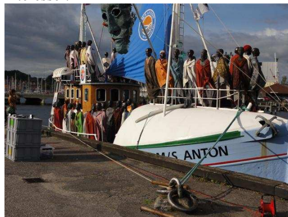
Levende Hav er en miljøforening, som

Han bruger sin kunst til at forsvare vores etiske humanistiske værdier uafhængigt af politiske, religiøse og økonomiske interesser.