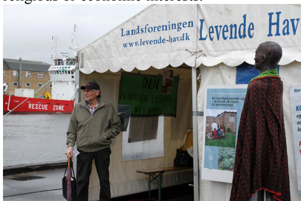
Living Sea is an environmental association