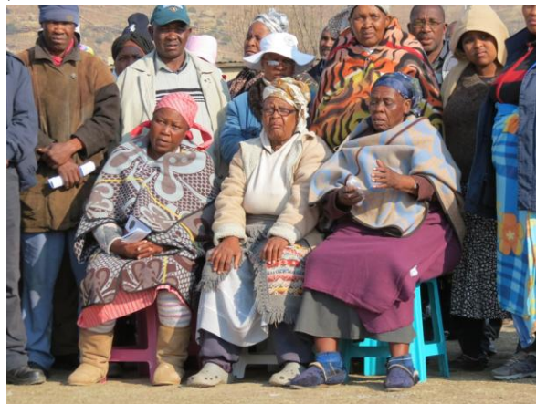
Landsbymøderne samler mange hundrede deltagere i alle aldre.

Challenge Cooperation, der har fastsat de økonomiske rammer.