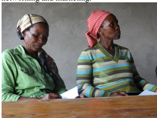
New products are discussed e.g. biltong and dried peaches.

During the project the 40 farmer groups that are supported have come to understand the importance of advocacy, and 8 of the groups have been registered, which is a prerequisite for them to open a bank account. They have been trained in self-organization, networking and marketing.