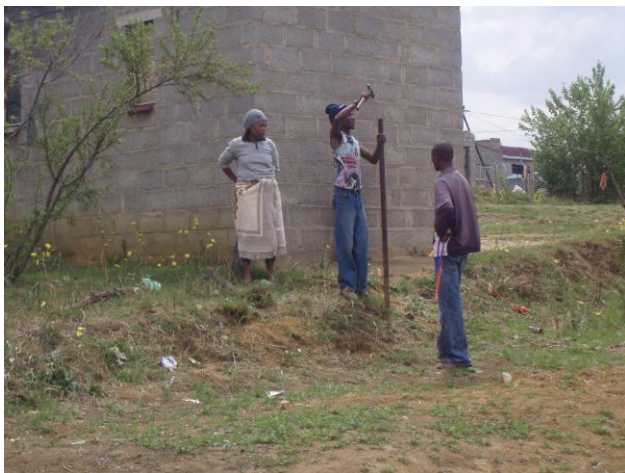
A parcel has to be properly marked to become registered.

The land regularization project will be implemented in the urban and peri-urban areas of the capital city Maseru. The main objective