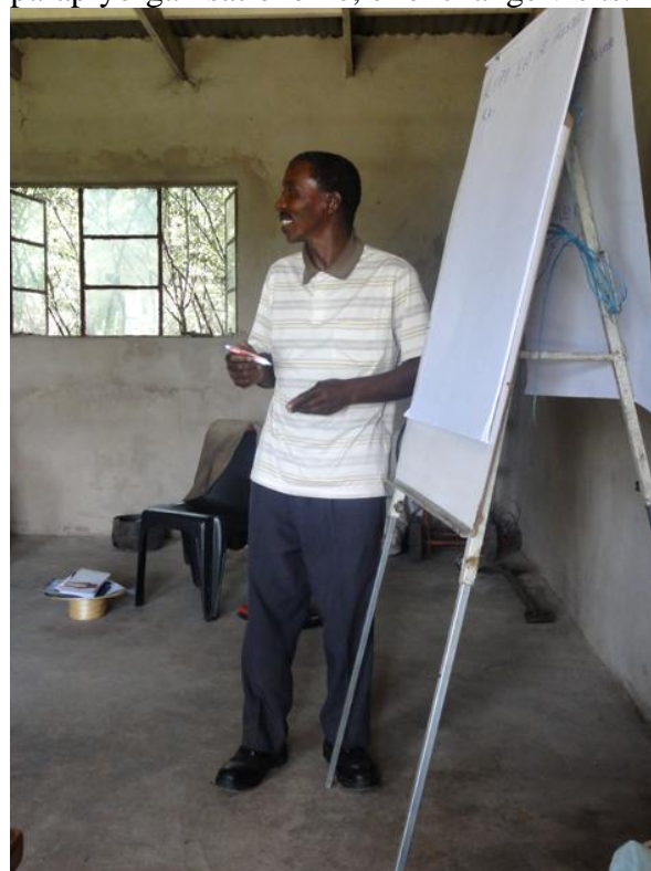
Møde i en paraplyorganisation, hvor der diskuteres nye ideer.

paraplyorganisationerne, er exchange visits.