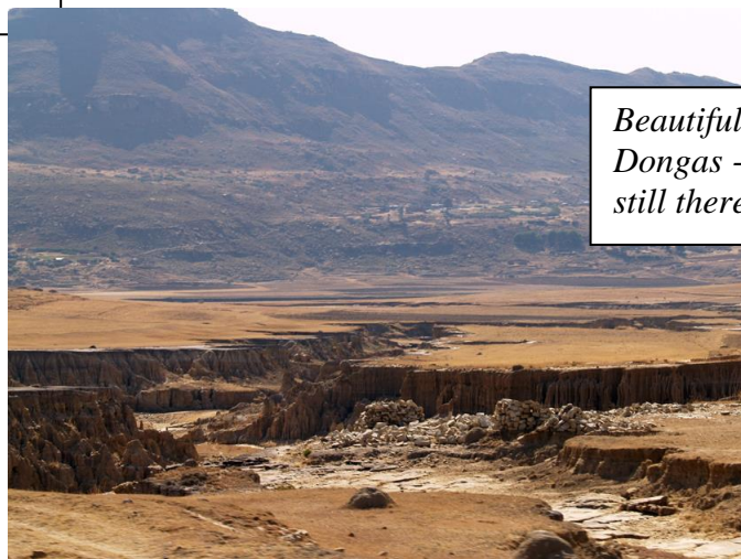
Beautiful Dongas - still there