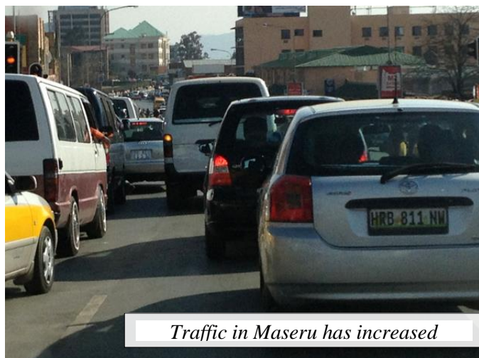
Traffic in Maseru has increased

The next text in Danish is invitation from MS to all Danish people send out by MS the last 50 years. They want to celebrate the 50 anniversary.