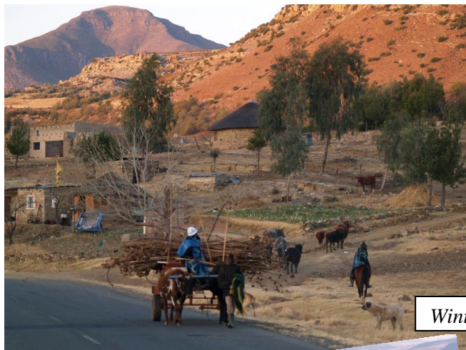
Winter in Lesotho