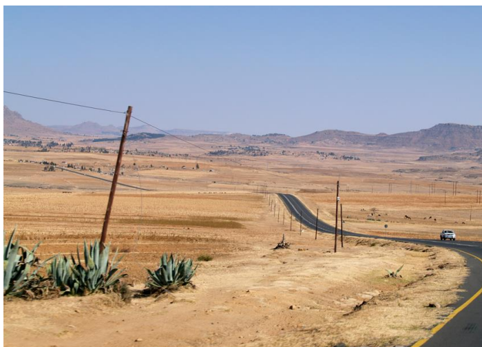
The road to Mafetheng. Winter in Lesotho as it is: Dry