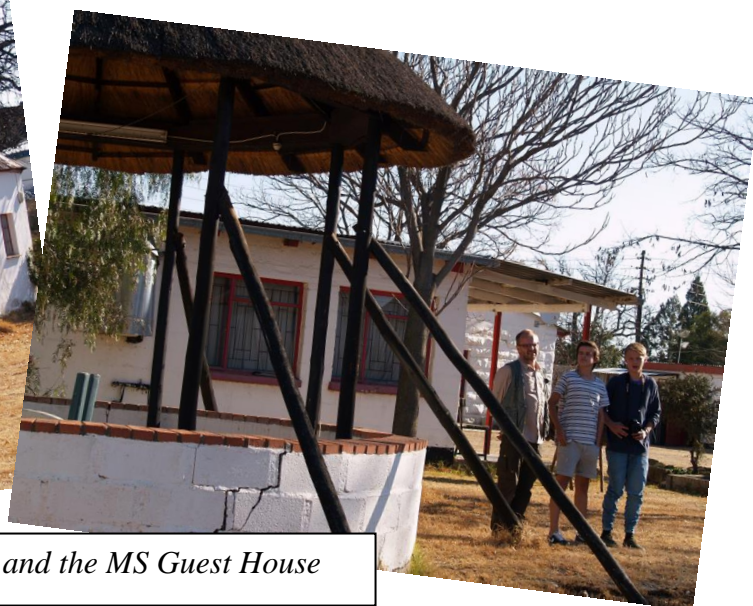
Mabile House and the MS Guest House