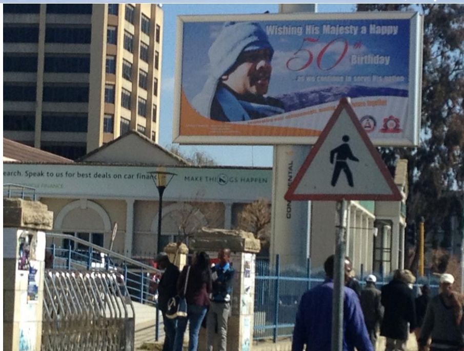
Birthday party coming up