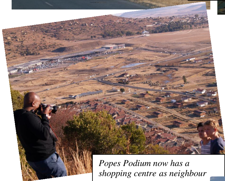
Popes Podium now has a shopping centre as neighbour