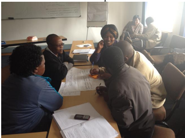
Workshop in Maseru with community animators

As a newcomer in DLN these meeting are absolutely the most rewarding and effective way to understand DLN and DPE's cooperating and areas of work and to get directly in contact with DPE's beneficiaries. It is important to look them in their eyes, listen to their wants, frustrations, worries, thoughts and ideas – it can not be done from the distance. These people are the foundation of DPE's work and the reason why DLN is engaged in Lesotho. That is why the first were not only the most intense, but also most informative on the entire trip.