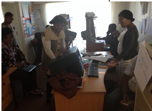
The DPE office and staff