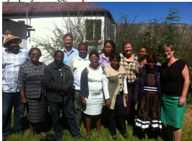
DPE incl. 2 bestyrelsesmedlemmer

DPEs og projektets interessenter. Interessenterne inkluderede repræsentanter fra forskellige ministerier, repræsentanter fra civilsamfundet (bl.a. Lesotho Council of NGO's), og donorer (herunder UNDP). Her blev det klart at DPEs arbejde respekteres og værdsættes af alle aktører i samfundet, og flere viste interesse i at etablere et samarbejde med DPE i forbindelse med decentraliseringspolitikken. Derudover mødtes vi den sidste dag med to repræsentanter fra DPEs bestyrelse. De bekræftede os i projektets berettigelse, og udtrykte deres påskønnelse af det øgede og tættere samarbejde med DLN, som det nye projekt lægger op til.