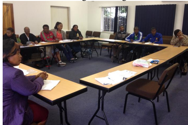
Workshop i Maseru – med community animators

Det gjorde naturligvis ikke denne 2-dagestur mindre mindeværdig, at vores bil brød sammen på en bjergtop, at vores 'redningsbil' mistede et forhjul, og at vi kvinder blev sendt til floden for at hente vand den følgende morgen.