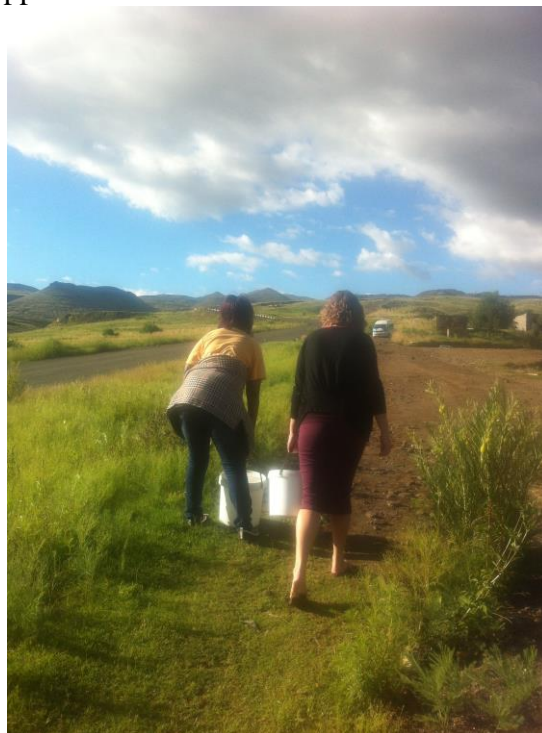
Henter vand ved floden i Seforong, Quthing