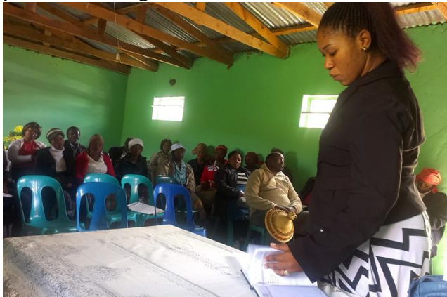
Workshop in Seforong, Quthing

responsibilities in different level of the public institutions and education in conflict and problem solving.