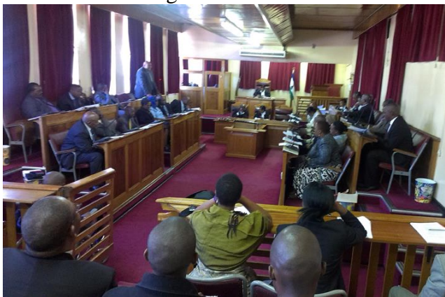
In the Parliament

Lesotho Council of NGO's) and donors (as UNDP). It was apparent that DPE's work is highly valued and respected by all agents of society, and many of the invited organisations and individuals showed interest in establishing a partnership with DPE regarding the decentralisation legislation.