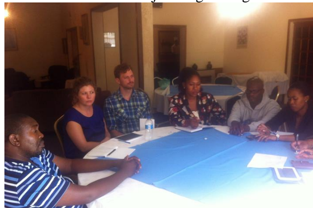
Møde med district representatives, Quthing