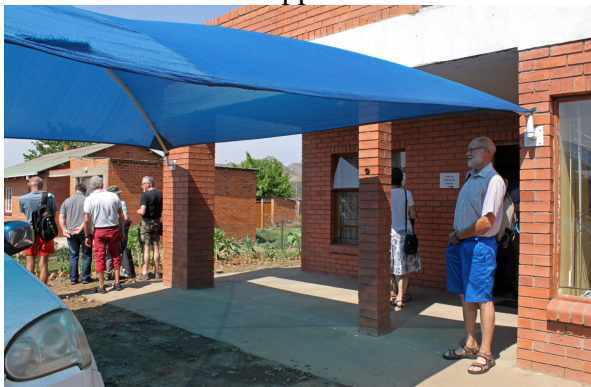
Visit at RSDA office

RSDA as well as the project group are convinced that the report will be a useful document for future applications.