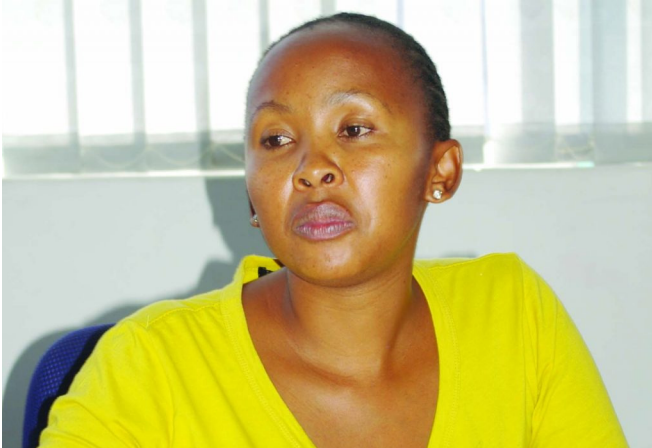
Ministry of Trade and Industry Lihaelo Nkaota

Posted by :Lestimes Posted date : August 17, 2017