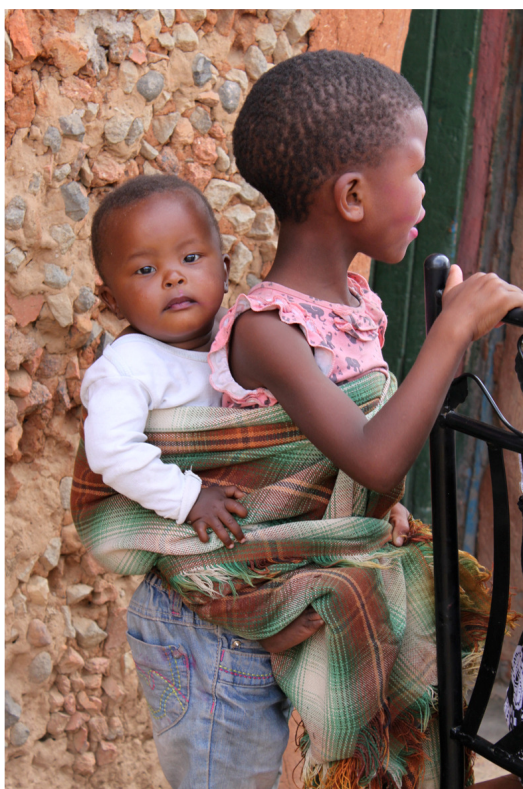
Young girl with a baby

DLN is looking forward to have another Cultural Trip to Lesotho in the beginning of November this year. It is a group of 11 people. Some have been in Lesotho several times and others will be there for the very first time. Those who have great friendships in Lesotho are looking really much forward to meet Basotho again and to show the beginners why we are so much in love with the Basotho Culture, people and landscape.