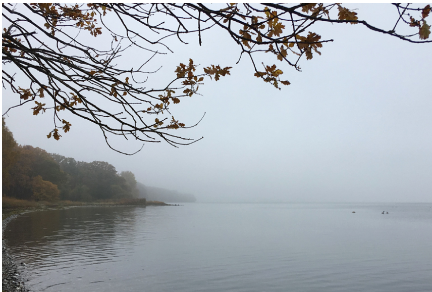
This is not the Kingdom in the sky, but the Kingdom in the Clouds

Merry Christmas and a Happy New Year to every reader of this Newsletter.