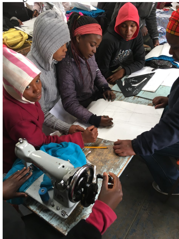
Dem, der lærer hurtigt, hjælper dem, der har det sværere.

større veldrevet skole for fysisk og mentalt handicappede elever, en landbrugsskole, en skole for blinde, og et katolsk skole for teenagemødre.