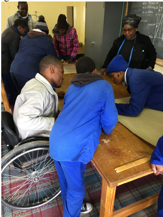
Teaching at a college for the disabled

The Board is working to prepare a weekend with a vision day and Annual General Meeting, similar to the event we had nearly three years ago. We have decided on Nyborg, March 30-31 2019, and all members are welcome. Please enter the dates in your calendars if you want to participate. More about registration and the programme after New Year.