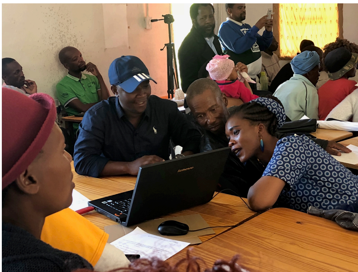
Very interested users of the new Community Library