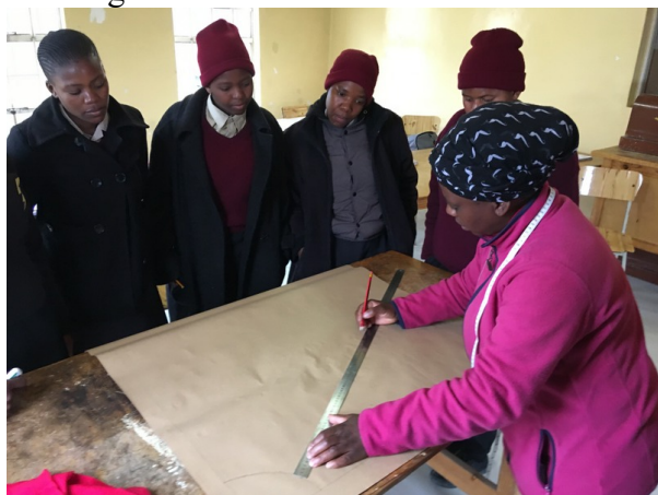
Getting the pattern for the dress correct!