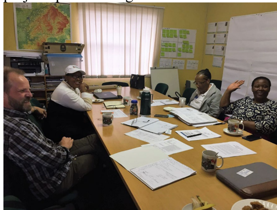
Strategisk refleksion efter godkendelsen af ansøgningen

Umiddelbart har vi som DLN projektgruppe et ønske om at yde størst mulig støtte og opbakning til vores partner i den altid svære opstartsfase. Men hvordan gør vi det? Hvor er behovet for støtte og opbakning størst? Hvordan er det, vi som partner kan byde ind? DLN og RSDA har efterhånden arbejdet sammen i 14 år. Sammen har vi gennem årene afviklet 3 større og 1 mindre projekt. Lesotho Agriculture and Food Forum – projektet er således det femte og også det mest ambitiøse projekt i DLN-RSDA partnerskabet.