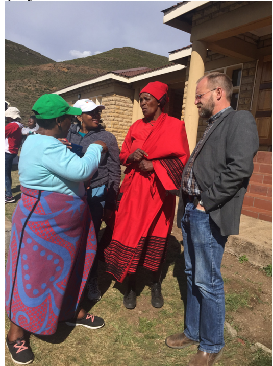
Uformel snak mellem RSDA ledere og bøndernes repræsentanter fra Phamong

Adskillige folk fra DLN har været i Lesotho i oktober. To personer fra RSDA-projektgruppen har været på besøg i forbindelse med opstart af nyt projekt.