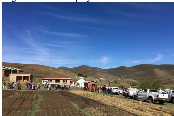
The World Food Day

DLN and RSDA have now worked together for 14 years. Together we have implemented three large and one small project. 'Lesotho