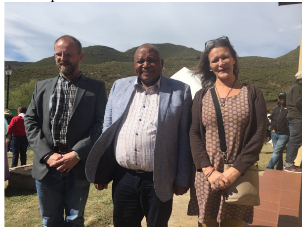
Uformel snak med Minister of Agriculture

For det første bliver vi heldigvis klogere fra det tidspunkt, hvor projektet beskrives, til projektet skal implementeres.