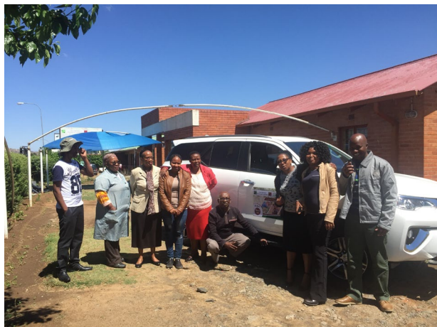
RSDA Staff welcomes the new RSDA Toyota Fortuner

For example, RSDA's relations with partners develop and change from day to day. That includes all levels: From relations to individual farmers in the field, farmer leaders, regional agriculture consultants and extension workers, via partners and co-operators amongst other NGOs in Lesotho and all the way up to Department Heads and Ministers.