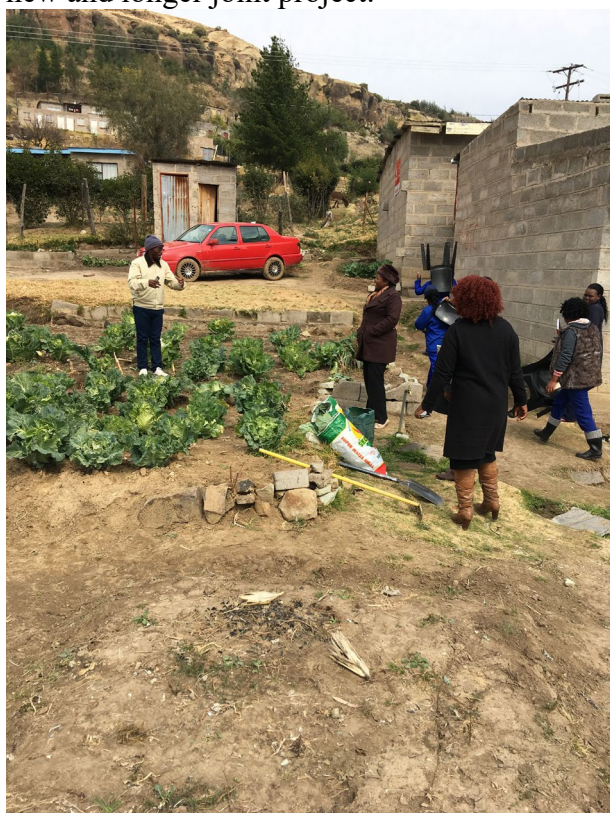
Learning to cultivate crops at the agriculture college The Director of Vocational Education and

The last day of the programme was dedicated to a final workshop for all participants. The purpose was to make a joint review of the experience so far, and on identifying possible further needs that might become the basis of a new and longer joint project.