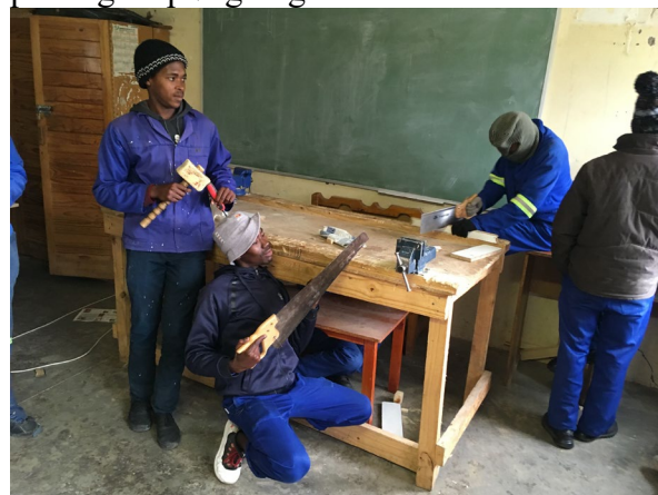
Der er meget koldt på tømrerværkstedet om vinteren.