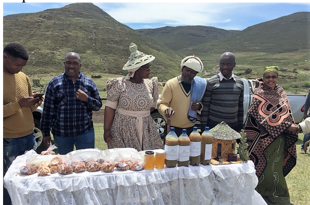
Local farmers presenting food products at World Food Day

For example, RSDA's relations with partners develop and change from day to day. That includes all levels: From relations to individual farmers in the field, farmer leaders, regional agriculture consultants and extension workers, via partners and co-operators amongst other NGOs in Lesotho and all the way up to Department Heads and Ministers.